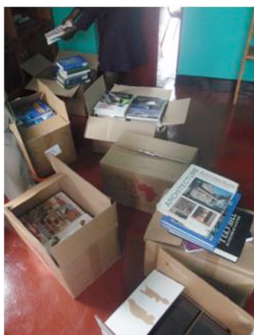
Above: Boxes of donated books arrive at the library space in September 2010