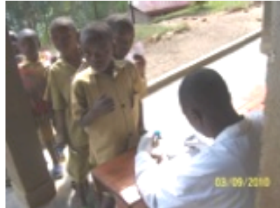
Collection of stool specimens