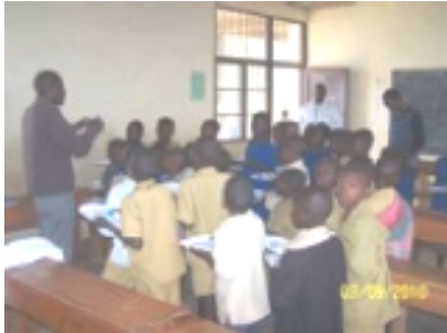
Briefing to school children

(MAL) for the spleen. The firmness of each palpable organ was recorded as normal, soft, firm or hard.