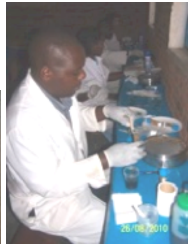
Preparation of KK slides