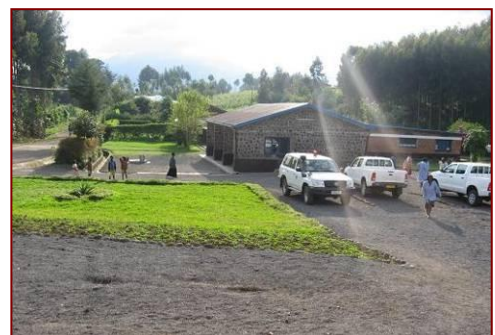
Kinigi Health Center before and after. Standing water presented a significant health problem; infrastructure improvements have improved both the appearance and the hygiene of the center.